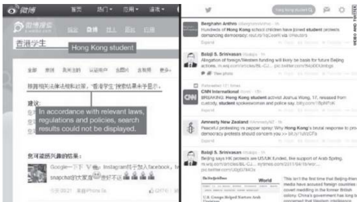
FIGURE 4. THE CHINESE GOVERNMENT CENSORSHIP OF THE HONG KONG DEMONSTRATION ON WEIBO

The notice was "In accordance with relevant laws, regulations, and policies, the search results could not be displayed". Another keyword such as Jasmine, Egypt, Ai Weiwei, Zengcheng, Beijing Occupy, Occupy Wall Street, etc. are also prohibited in Weibo (Bamvan, O'Connor, & Smith, 2012:3). The highest statistical forbidden keyword in the period of 2014 was Hong Kong because Chinese government assumed it could evoke reactions of citizens and repeat the tragedy of Tiananmen 1989 demanding democracy in China.