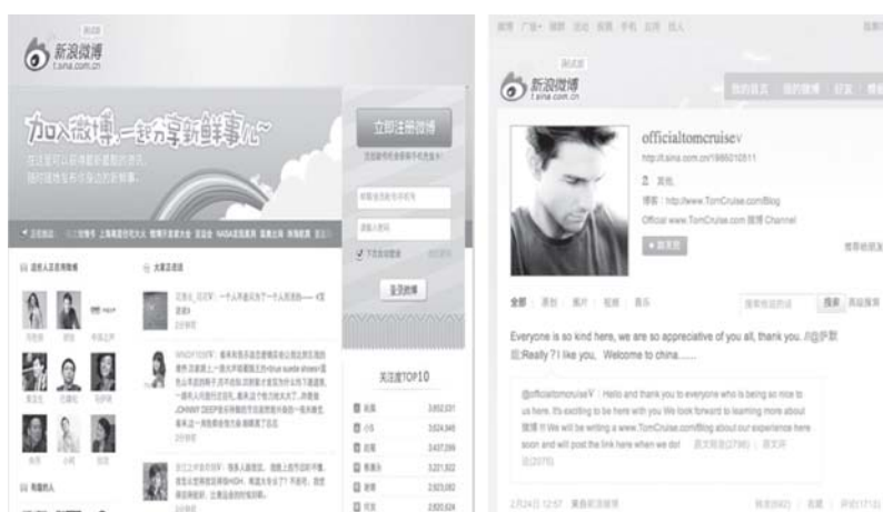
Figure 2. Weibo homepage and Hollywood Actor's official page (Source: http://blogs.ubc.ca/carlytaojing/files/2012/01/crt_weibo_G_20101116094909.jpg ; https://www.techinasia.netdna-ssl.com/wp-content/uploads/2011/02/tom-cruise-sina-weibo.jpg?71bc4c , accessed on 22 October 2014)

Weibo's fever has attracted some news sites and online portals to highlight the euphoria. Government, political elites, opinion makers, and academics in the country have their own Weibo. Even international celebrities open their own Weibo's page.