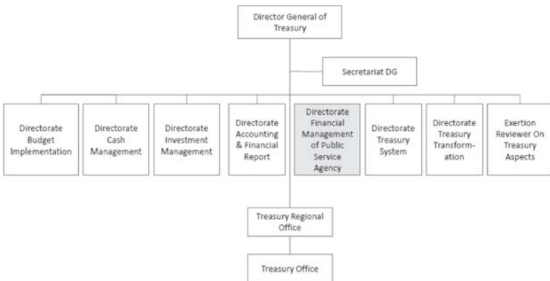
[FIGURE 2] ORGANIZATION CHART OF THE DG TREASURY OF THE MINISTRY OF FINANCE

Along with the MoF, line ministries are one of core pillars in the PSA governance. As briefly mentioned above, many government organizations that provide public services to citizens wish to get a PSA status because PSAs are privileged to enjoy a wide range of autonomy with a low degree of requirements for accountability and